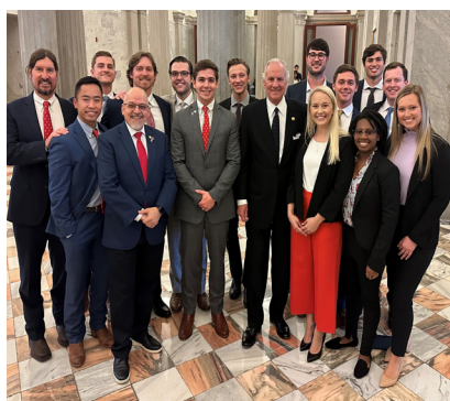
MUSC South Carolina ASDA students in Columbia, SC, for the 2023 Student Lobby Day.