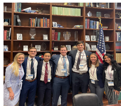
MUSC South Carolina ASDA students in Washington, D.C. for the 2022 Lobby Day.