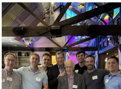
MUSC South Carolina ASDA students recently met ADPAC board members in Charleston, SC.

My hope for our students is that, through these experiences, they gain an understanding of the impact of public policy on healthcare. This knowledge will serve them throughout their careers. I also believe that they will be inspired to continue their involvement with the ADA, with the purpose of growing and advocating for our profession, after graduation.