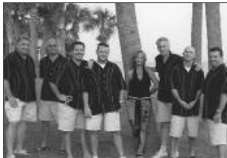
East Coast Party Band

The weekend will wrap with our President's Reception Saturday night. Group Dynamics will provide us with a fun-filled night of casino and horse racing with the added twist of a puzzle! This goes along with our meeting theme "Finding the Solution to the Future in Dentistry in South Carolina". Music is included for those who want to dance." No doubt this will be fun-filled exciting events. Hope to see you there.