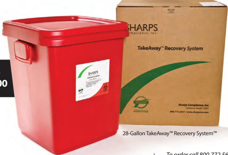
28-Gallon TakeAway™ Recovery System™

Sharps Compliance is proud to be endorsed by the SCDA!