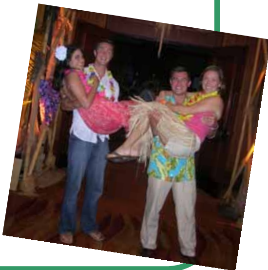
Celebrating a successful ASDA Annual Meeting