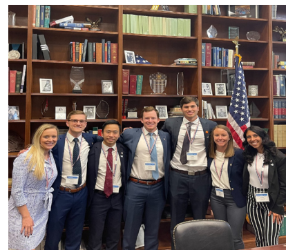
MUSC South Carolina ASDA students in Washington, D.C. for the 2022 Lobby Day.