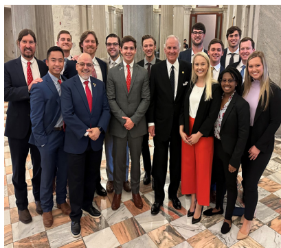
MUSC South Carolina ASDA students in Columbia, SC, for the 2023 Student Lobby Day.