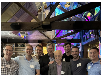
MUSC South Carolina ASDA students recently met ADPAC board members in Charleston, SC.

My hope for our students is that, through these experiences, they gain an understanding of the impact of public policy on healthcare. This knowledge will serve them throughout their careers. I also believe that they will be inspired to continue their involvement with the ADA, with the purpose of growing and advocating for our profession, after graduation.